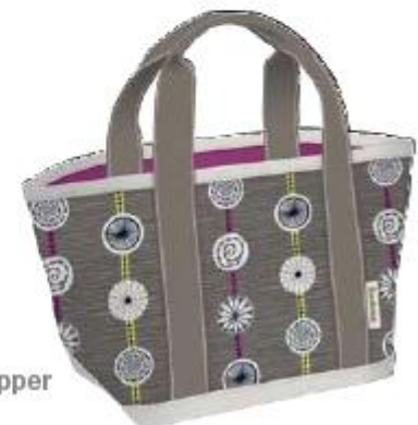
Small Shopper SANC8858