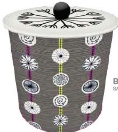
Biscuit Barrel SANC8864