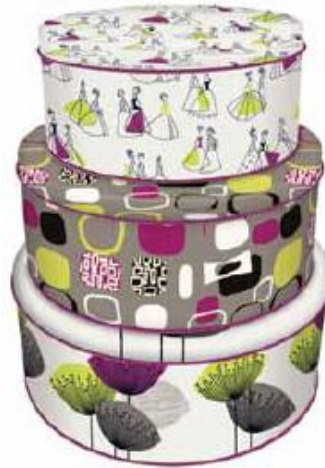
Cake Tins SANC8861