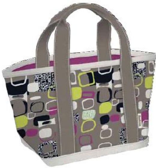
Large Shopper SANC8859