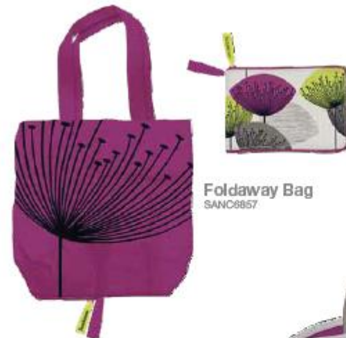
Foldaway Bag SANC8857