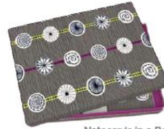
Notecards in a Box SANC8853 12 notecards and envelope, 3 assorted designs